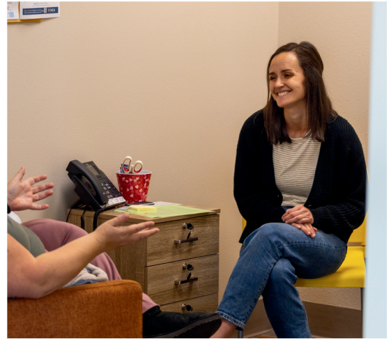
SACA connects people to a variety of programs and services.